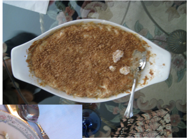
Carmelized Sweet Onion Dip