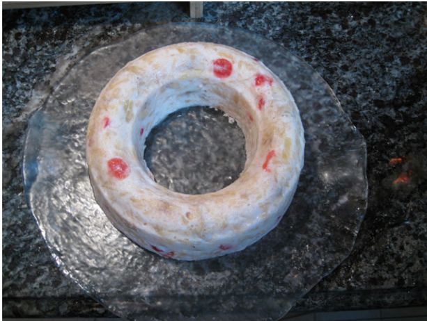
Vivi's Salad Mold