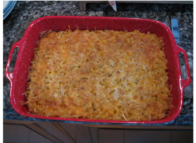
Baked Mac n Cheese